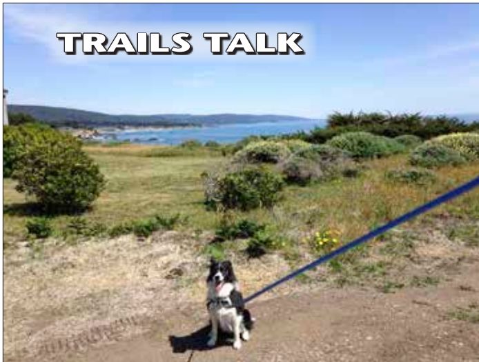
Beau on Bluff Trail