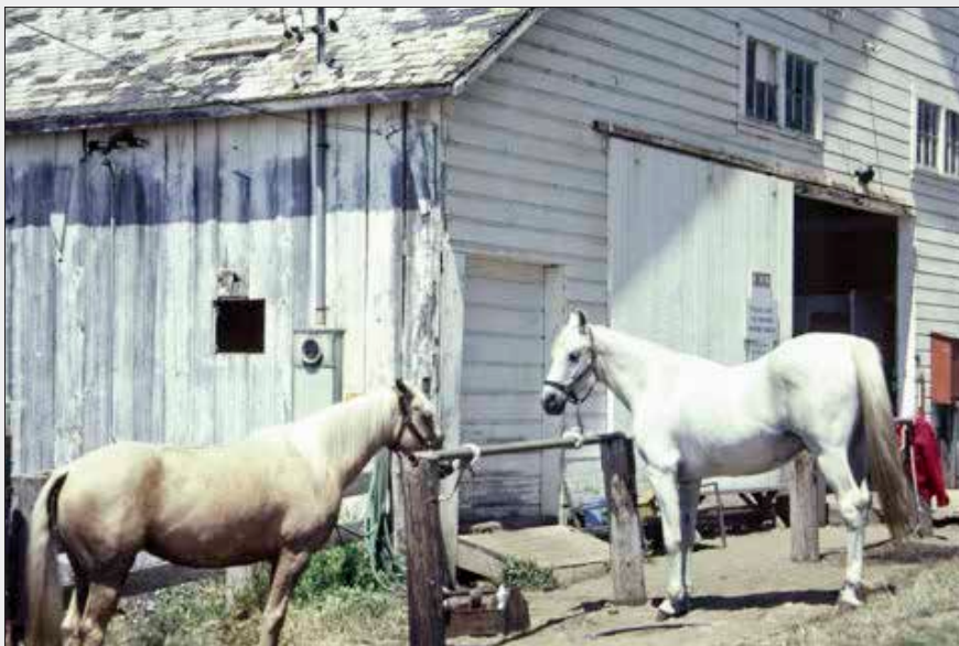
Knipp-Stengel Barn, early 1980s.